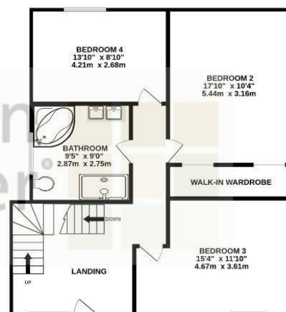
1ST FLOOR 723 sq.ft. (67.1 sq.m.) approx.